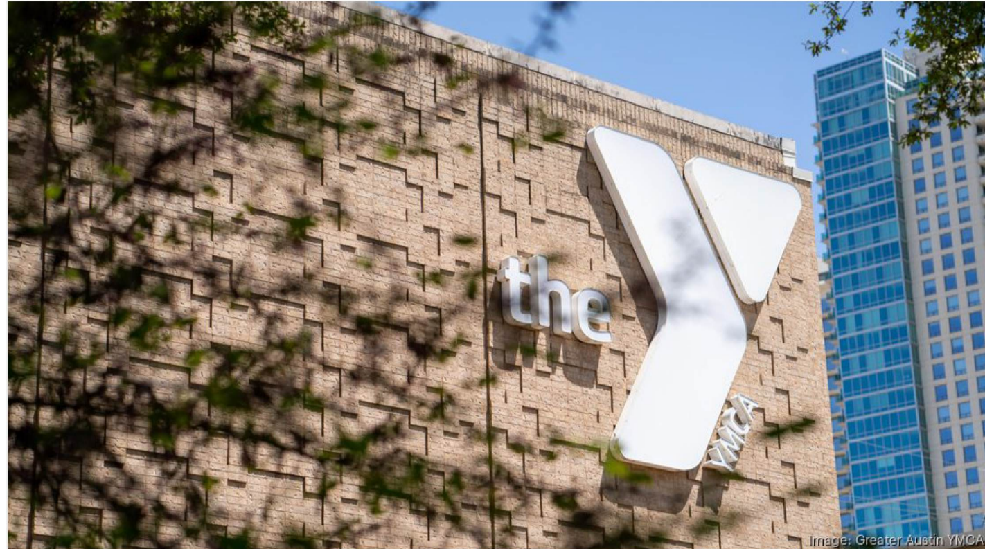
The exterior of the Townlake YMA, which could be redeveloped to add a new facility and housing.

Other YMCA sites may see similar revamps in years to come